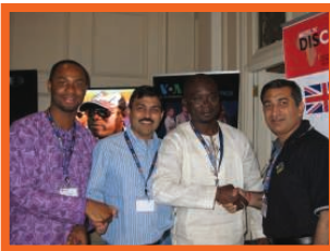
MEETINGS ARE PLANNED AHEAD OF TIME BY OUR IN HOUSE TEAM OF 'MATCHMAKERS'

EARLY REGISTRATION IS THEREFORE RECOMMENDED