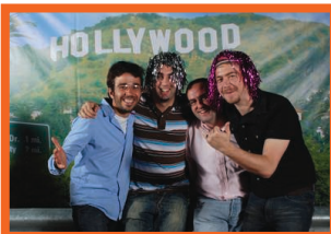
DISCOP PARTIES ARE RENOWNED FOR THEIR NETWORKING POWER