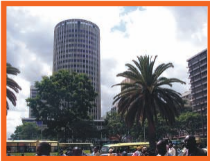
DISCOP EVENTS TAKE PLACE IN 5-STAR RESORTS

I-3 September 2010 • HILTON NAIROBI • KENYA