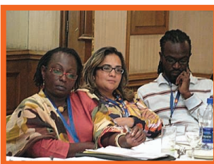
TRAINING AND PITCHING SESSIONS - CENTRED ON INTRA-REGIONAL COPRODUCTION OPPORTUNITIES

Launched in 1991, DISCOP markets cover fast-growing world regions where tangible, human connections are still crucial drivers of business, as these marketplaces account for a fast-growing portion of all content licensing revenues generated worldwide.