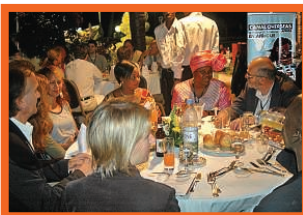
LIMITED HIGH-IMPACT SPONSORSHIPS ARE AVAILABLE