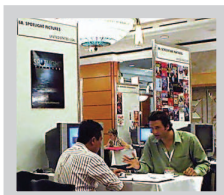
An average of 40 meetings per participant during the market