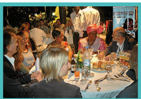
LIMITED HIGH-IMPACT SPONSORSHIPS ARE AVAILABLE