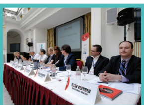
TRAINING AND PITCHING SESSIONS CENTRED ON INTRA-REGIONAL COPRODUCTION OPPORTUNITIES

Launched in 1991, DISCOP markets cover fast-growing world regions where tangible, human connections are still crucial drivers of business, as these marketplaces account for a fast-growing portion of all content licensing revenues generated worldwide.