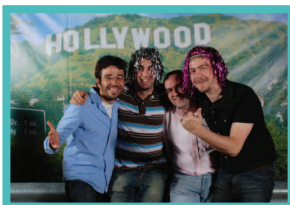
DISCOP PARTIES ARE RENOWNED FOR THEIR NETWORKING POWER