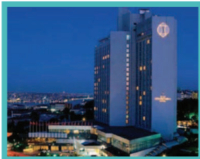
DISCOP EVENTS TAKE PLACE IN 5-STAR RESORTS

Broader Middle East, Central Asia + North Africa