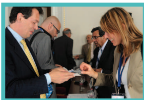
MEETINGS ARE PLANNED AHEAD OF TIME BY OUR IN HOUSE TEAM OF 'MATCHMAKERS'

DISCOUNTS AVAILABLE FOR ATTENDING MORE THAN ONE DISCOP IF YOU APPLY BEFORE 29 OCTOBER 2010