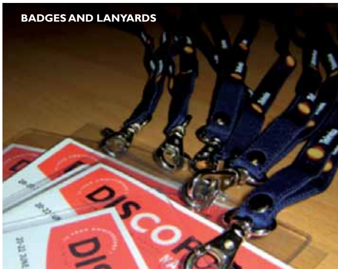
BADGES AND LANYARDS